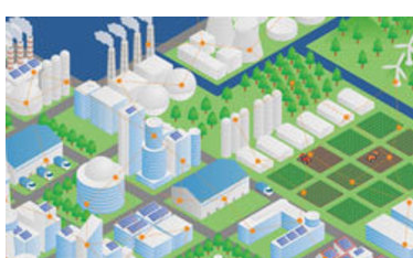
Major trends in ag-tech for 2018