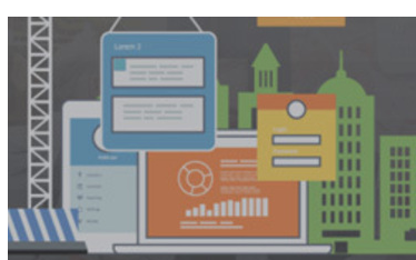
Web Marketing Trends for Construction and Trades