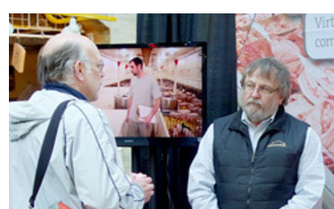
Our Public Trust Opportunity